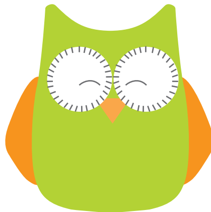
Stitch sleepy eyes and around whites of eyes.